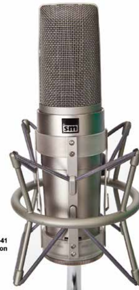
Shown with Included S-41 Shock Mount Suspension